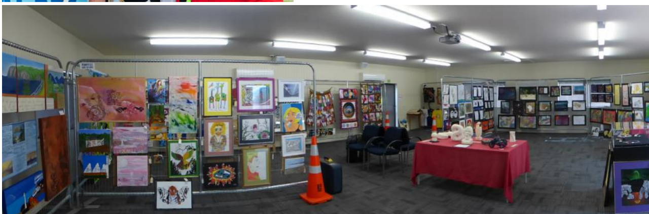
Below: The Art Exhibition: Destination Wellbeing