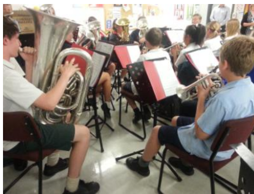
Children from the Rolleston School and Selwyn Youth brass bands entertained at the cheque presentation