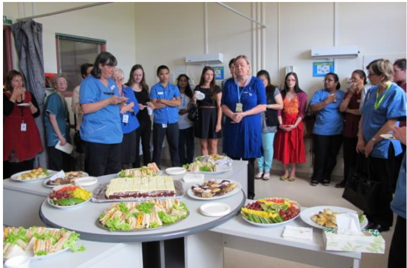
Acute Medical staff celebrate their return to Christchurch Hospital