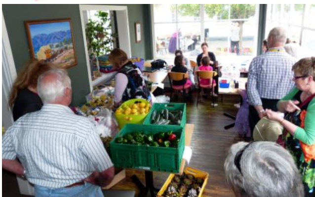
One of the inside stalls

View more photos from the day and have a look at a video covering the opening day of commemorations.