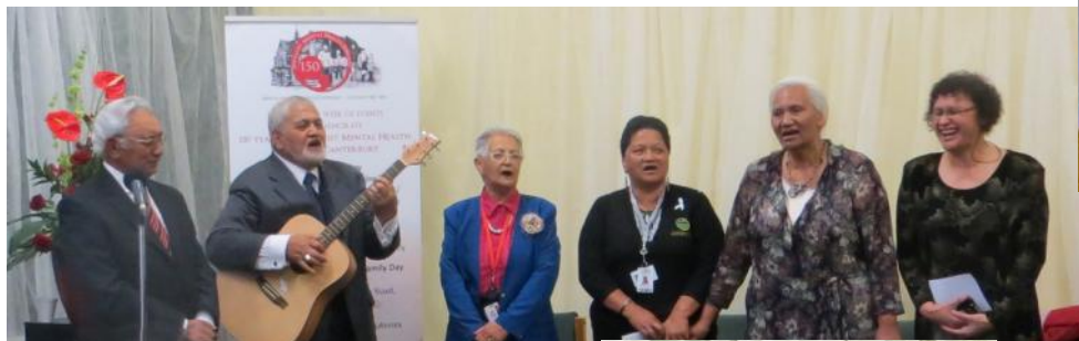
Waiata played a key role in the opening

More photos from the opening of 150th Anniversary events