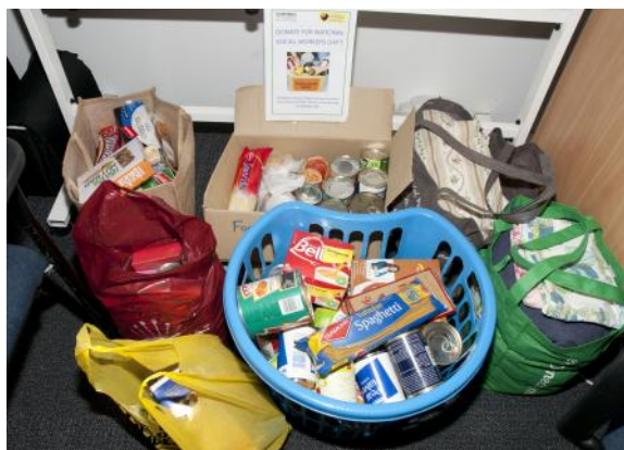
Left: Groceries: Donations of non-perishable food have gone to the Christchurch City Mission.